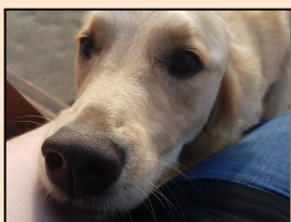
A Picture Of My Dog By Anonymous

If you could have anything as a pet what would it be?