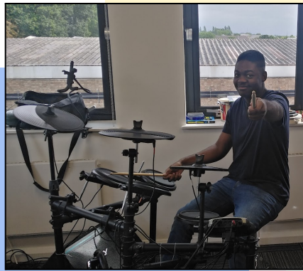
New Drum Kit In Music Room

Drums, unlike some other instruments, help you develop good coordination which is a skill that is transferable to other areas. Furthermore, drums have a much lower barrier to entry when compared to many other instruments as they require no prior knowledge to begin practising making them ideas as a beginner instrument.