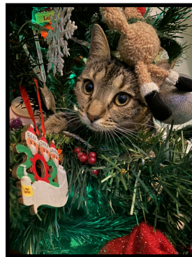
Poppy - ZB